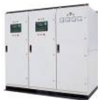
DSE-550 Parallel Control Panel system