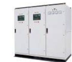
DSE-550 Parallel Control Panel system