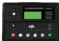
DSE-7320 Remote Control Panel