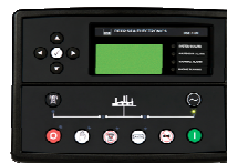
DSE-7320 Remote Control Panel