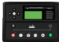
DSE-7320 Remote Control Panel