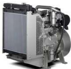
PERKINS Engine 1106A-70TAG2