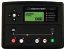
DSE7320 MKII AUTO START & AUTO MAINS