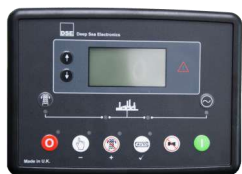
DSE7110 MKII AUTO START & AUTO MAINS FAILURE CONTROL