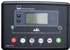
DSE7320 MKII AUTO START & AUTO MAINS FAILURE CONTROL