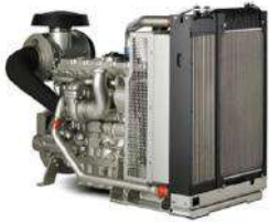
PERKINS Engine 1206A-E70TTAG3