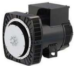
Leroy Somer TAL-046-D