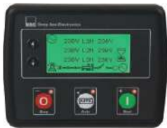
DSE4510 MKII AUTO START & AUTO MAINS FAILURE CONTROL