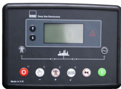
DSE7320 MKII AUTO START & AUTO MAINS FAILURE CONTROL