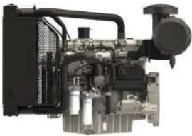
PERKINS Engine 1506A-E88TAG5