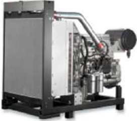
PERKINS Engine 2206A-E13TAG2