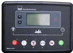
DSE7320 MKII AUTO START & AUTO MAINS FAILURE CONTROL