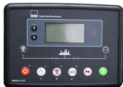
DSE7320 MKII AUTO START & AUTO MAINS FAILURE CONTROL

Please refer to Controller Data Sheet for more details.