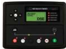
DSE7320 MKII AUTO START & AUTO MAINS