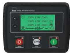
DSE4510 MKII AUTO START & AUTO MAINS FAILURE CONTROL