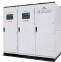
DSE-550 Parallel Control Panel system