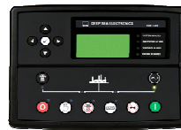
DSE-7320 Remote Control Panel