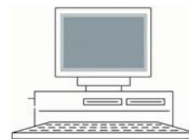
Control your generator remotely