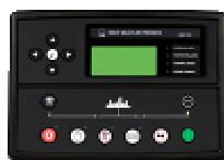
DSE 7420 Remote Control Panel