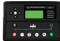
DSE 7420 Remote Control Panel