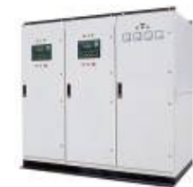
PLC-550 Parallel Control Panel system