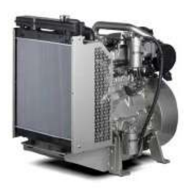
PERKINS Engine 1104C-44TAG2