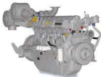
PERKINS Engine 4008-TAG2A