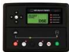
DSE7320 MKII AUTO START & AUTO MAINS