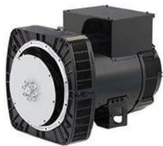
Leroy Somer LSA50.2 M6