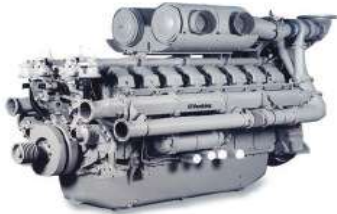
PERKINS Engine 4016-61TRG2