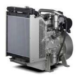
PERKINS Engine 1103A-33TG2