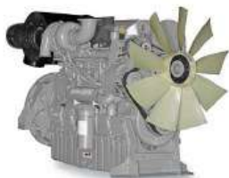
PERKINS Engine 2806A-E18TAG1A