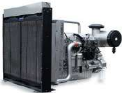
PERKINS Engine 2806A-E18TTAG 5