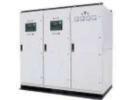
DSE-550 Parallel Control Panel system