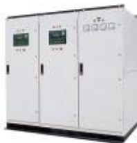
PLC-550 Parallel Control Panel system